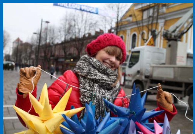
Environmentally-friendly Christmas Decorations Kaunas City, Lithuania

The project generated numerous discussions on the "environmental" origin of the project, which is a key result, showing that project encouraged people to start thinking about damage to forests and damage from PET production and plastic utilization.