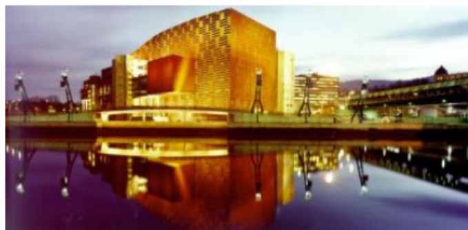
Palace of Congresses and Music of Bilbao.